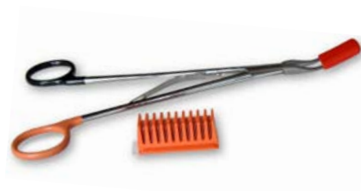
EASY LOAD - clip loading made simpler